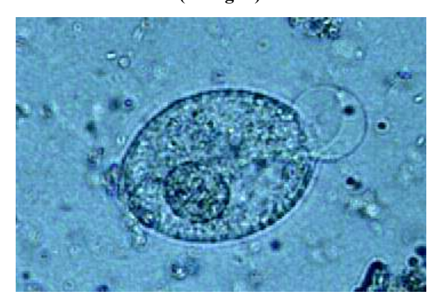
Figure 3: Morphological changes in anaerobic ciliate exposed to >8 mg l<sup>-1</sup> of Cd